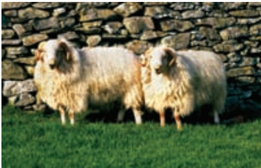
Welsh Mountain Rams