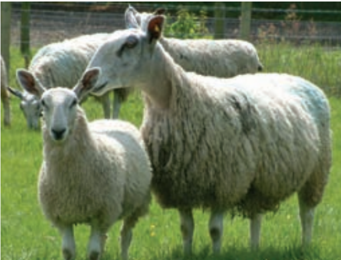
Blue Faced Leicester